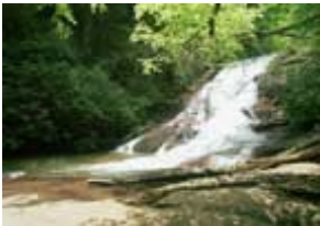
Lower Helton Creek Falls

Trail Information: The Helton Creek Falls Trail is an easy .2 mile hike. The lower falls drops over a 30' ledge, tumbling to a pool below. The second upper falls is a tall, full falls that drop at least 60 feet. Please be advised there are many abrupt changes in grade along this short walk. Please stay on the trail and observation deck!