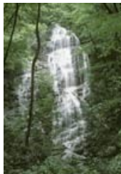
Horse Trough Falls